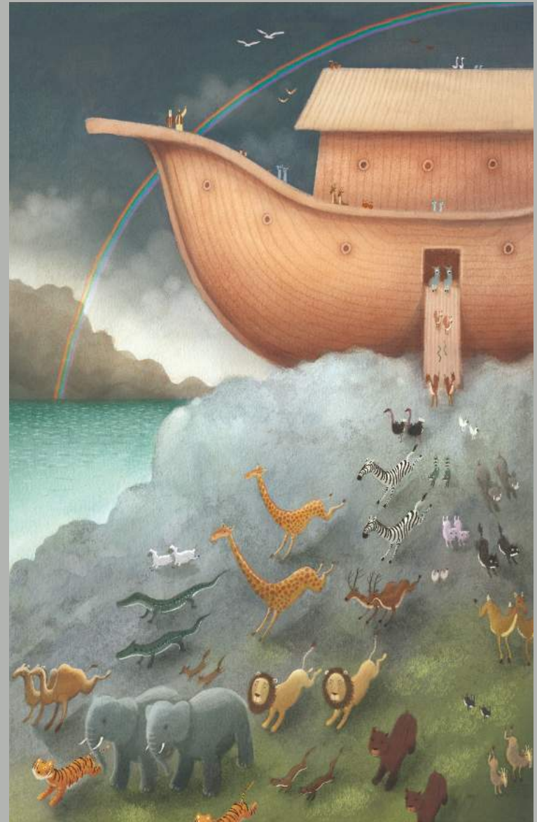
Noah's ark: go to page 25 and read the story in Genesis 6.9—9.17.

12 Joseph said to them, "No! You have come to find out where our country is weak."