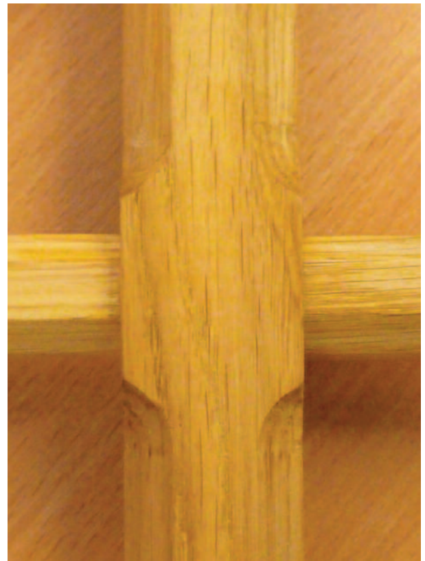
Fig.2 – Upper section with the short sections attached.