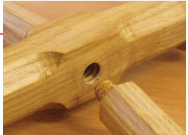
Fig.1 – Make sure you screw the correct short section into the correct hole.