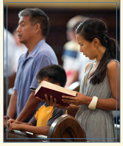
The Risen Christ is present to us most especially in the Eucharist, in the Word proclaimed, in the minister, and in the gathered assembly.

At church, we meet others who share our values. We give and