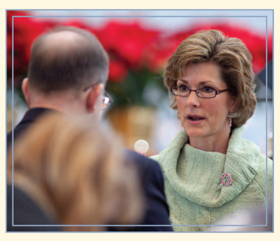
We receive the Eucharist in gratitude for all our God does for us.

We call the Mass Eucharist , which means "thanksgiving," or "to give thanks." The word Eucharist is often used to refer to the sacrament itself but