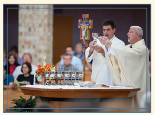
At Mass, we offer ourselves in sacrifice to God, and we share divine life in the Eucharist.

Together, the faithful raise one common voice in prayer. The people express their unity by assuming common postures and exchanging mutual